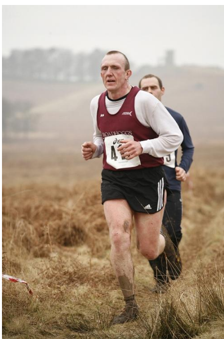
It's not quite New York, is it?