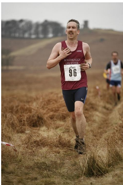
Not far now!