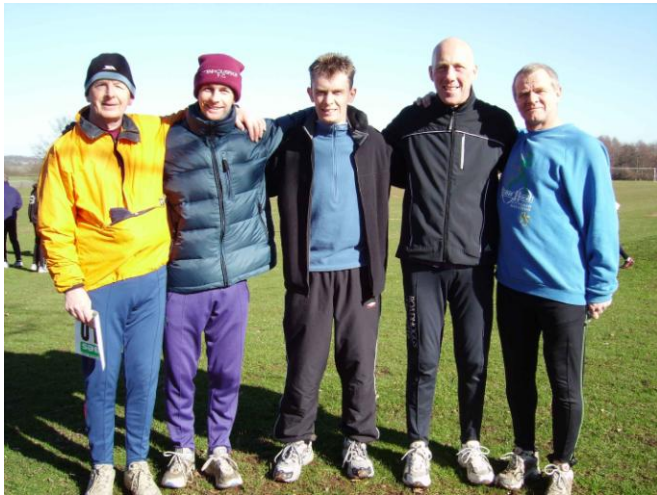
"Chests out....lovely boys!"