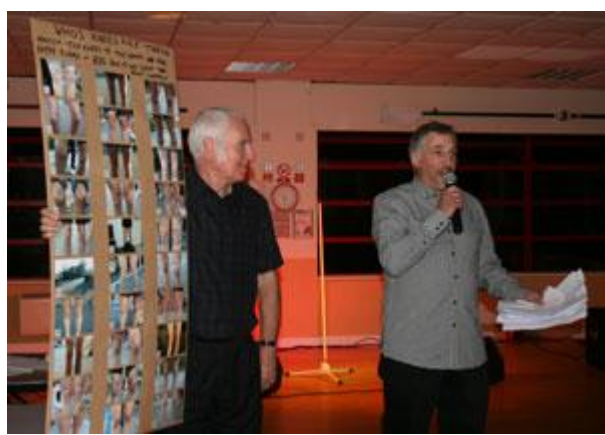
If he'd known 25 years ago that it would come to this...