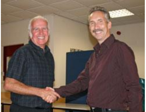
A proud moment!