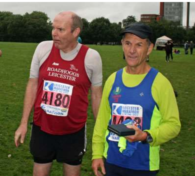
The charm offensive continues....