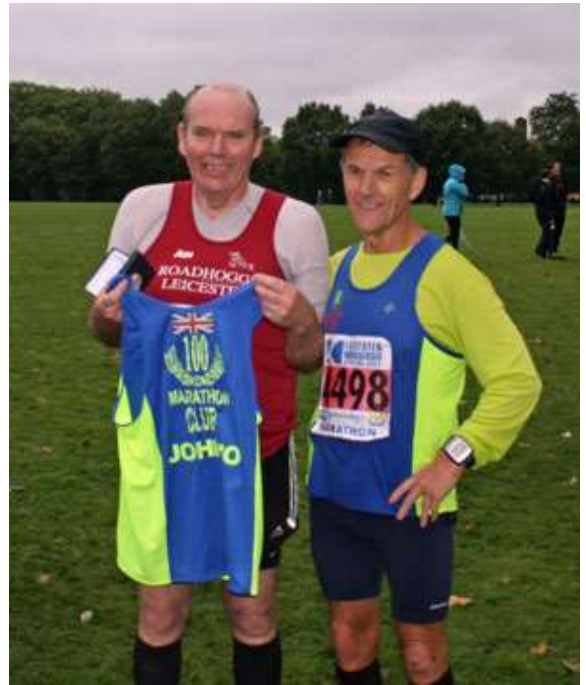
Don't think you're getting any of my cake...