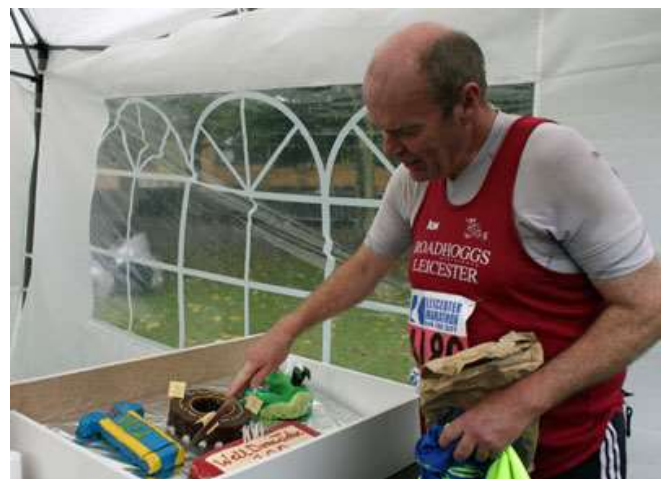
The things a man has to do to get a bit of cake round here...