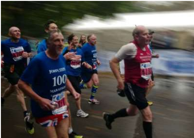
Chariots of fire