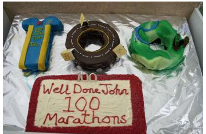
Trudy pulled out all the stops