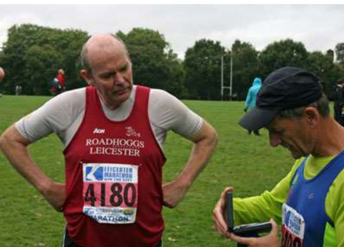
“....and they give these away in cereal packets”