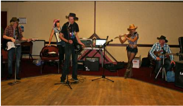
The East Clintwood Band in full flow

Roadhogs' cowboy-themed presentation evening must go down as one of the best ever. Mark supplied the food, Keith and the 'East Clintwood Band' supplied the entertainment and the lovely Leisure Centre staff kept the booze flowing. The decision to leave the partied-out and empty-pocketed doldrums of January and move the event to late November seemed to pay off. Another positive decision was to utilise the performing talents of members, rather than hire a band.