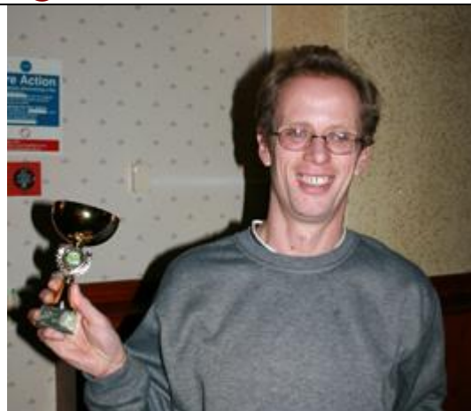
Time to reinforce the sideboard